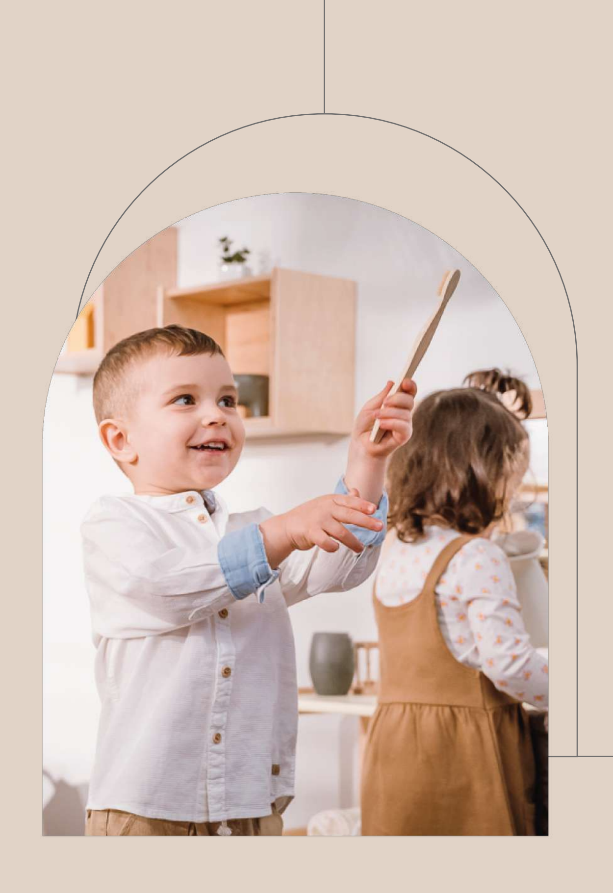
making plans for the day