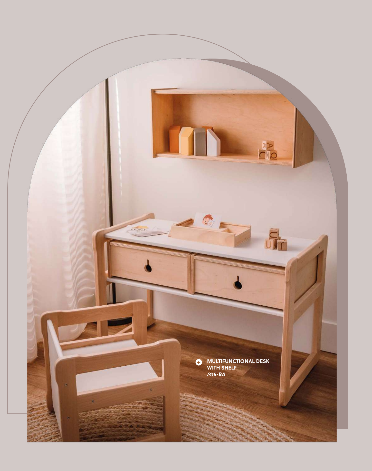
mix it up... side down!