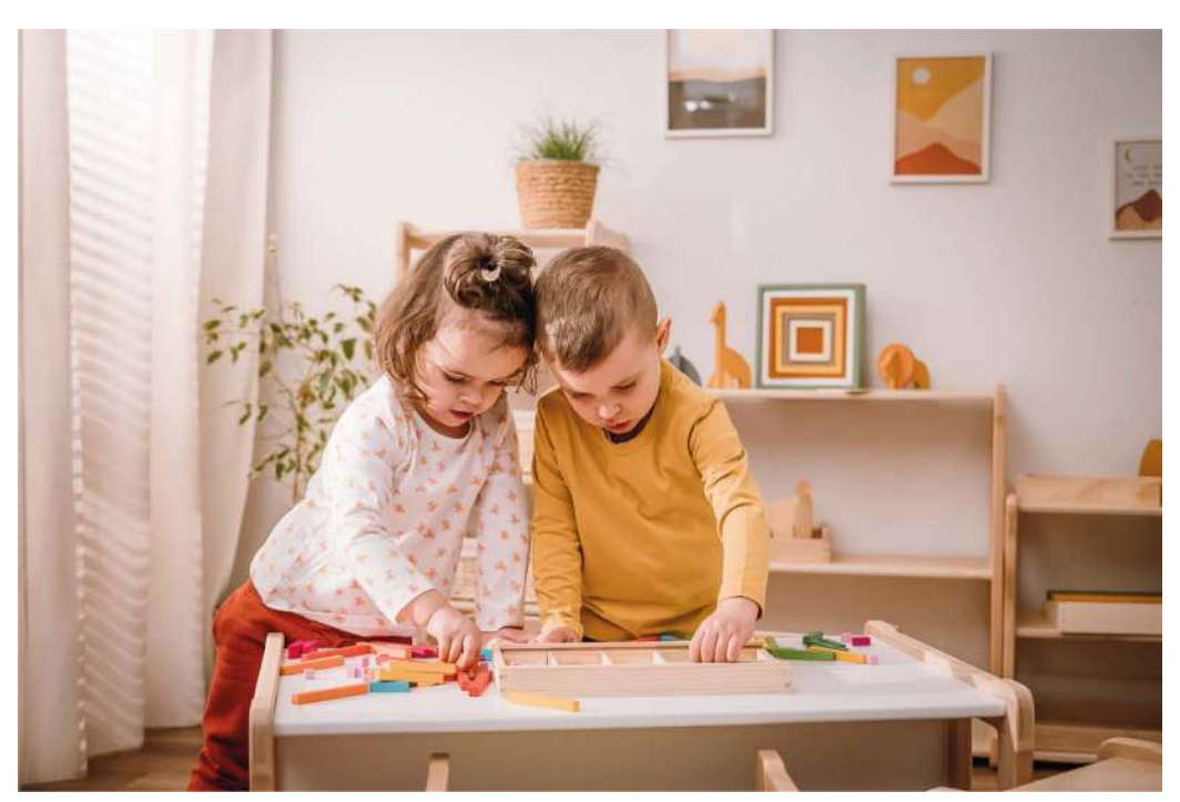
Montessori games are simple and fun activities leading the child towards their autonomy! WoodJoy products embrace this idea and help develop children's personality as well as their sense of perception.