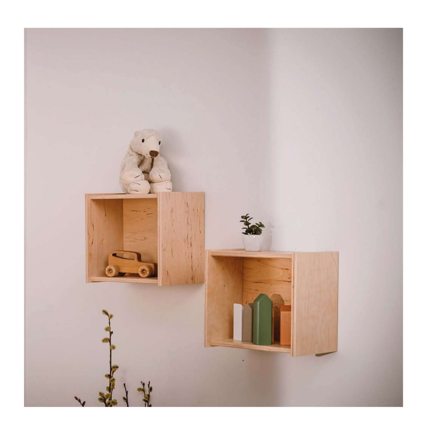
another box on the wall